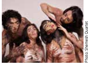
Photo: Shemesh Quartet